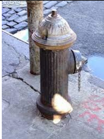
A fire hydrant