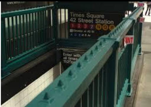
A subway station