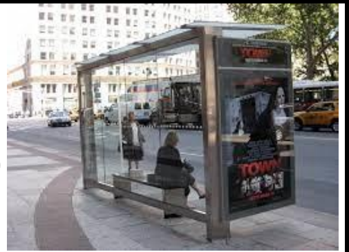
A bus stop